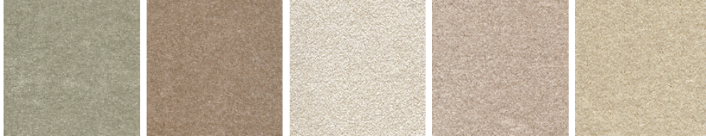
SENSATION 29 SENSATION 30 SENSATION 33 SENSATION 34 SENSATION 35