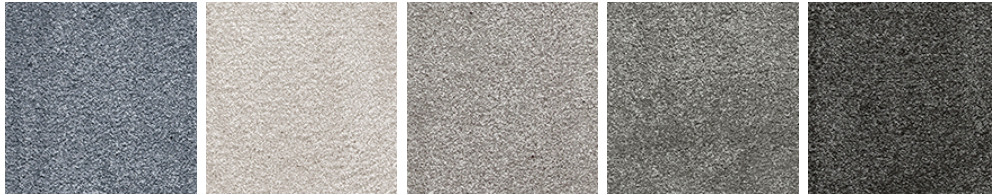
SENSATION 79 SENSATION 92 SENSATION 95 SENSATION 97 SENSATION 99