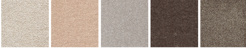
SENSATION 37 SENSATION 38 SENSATION 39 SENSATION 43 SENSATION 44