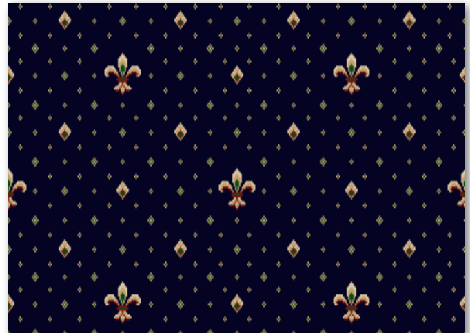
▲ Midnight 30