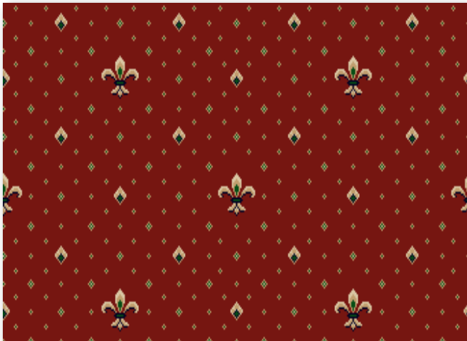
▲ Regel Red 10